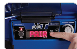
2. Pair gun to sprayer with a push of a button