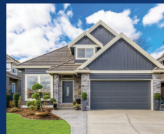
New Residential and Repaint

FOR EVERY PAINTING AND FINISHING APPLICATION