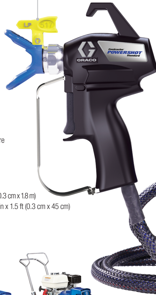
Contractor PowerShot Standard