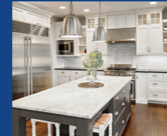
Finishing and Refinishing