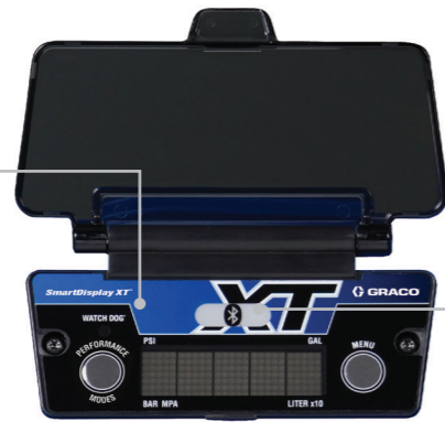
SmartDisplay XT Part Number: 20B432