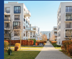
Maintenance and Remodeling