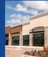
Commercial and Multifamily