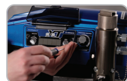
1. Install Smart Display in seconds