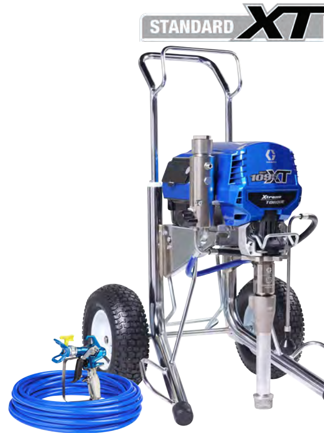
Ultra 1095 XT Standard Series

Larger painting jobs demand the proven quality and performance of Graco's Standard Series large electric sprayers to deliver a job well done, every time.