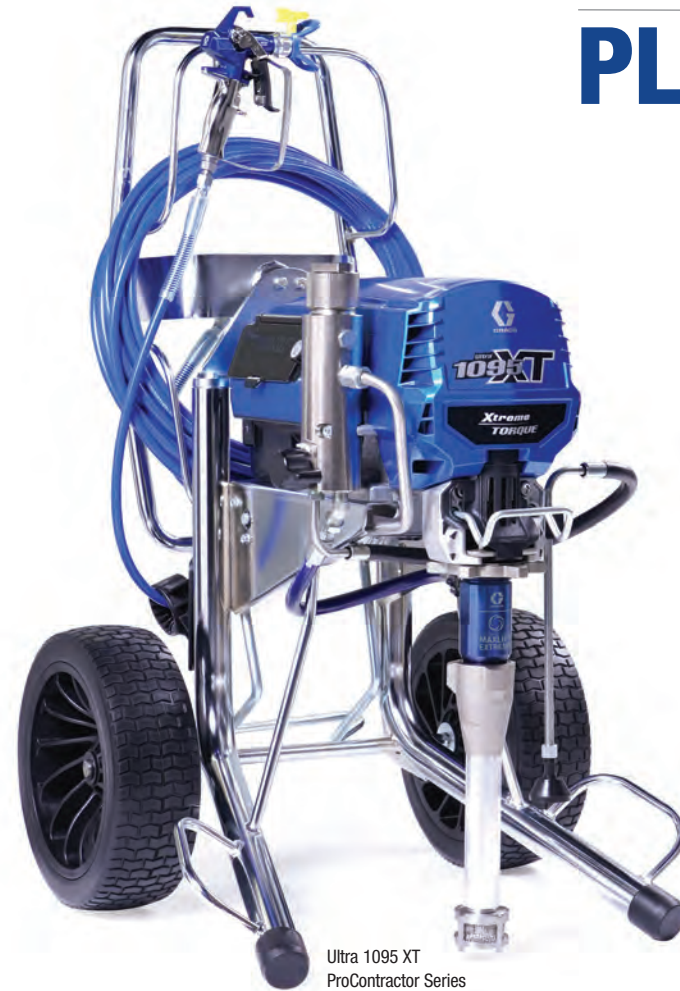
Ultra 1095 XT ProContractor Series