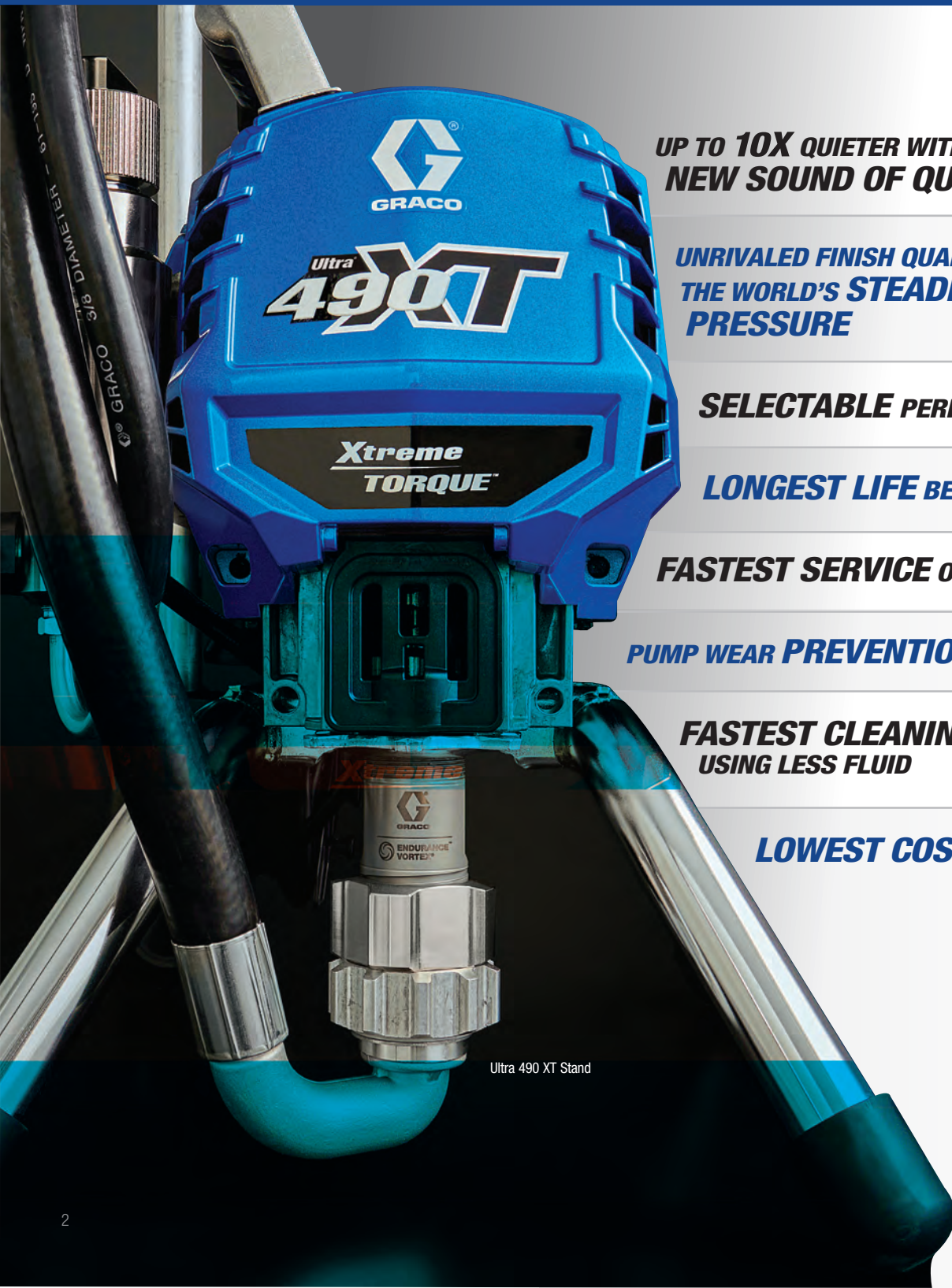
Ultra 490 XT Stand

UP TO 10X QUIETER WITH THE NEW SOUND OF QUALITY™