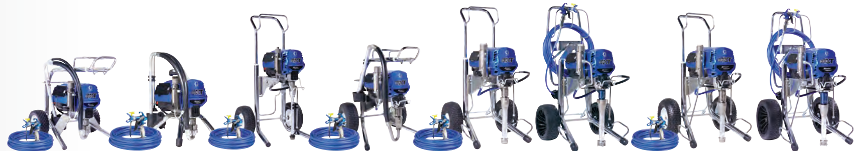
BREAKTHROUGH FEATURES ACROSS THE ENTIRE XT LINEUP

Intelligent auto-shutoff feature activates when the sprayer runs out of paint, safeguarding the pump and maintaining consistent performance.