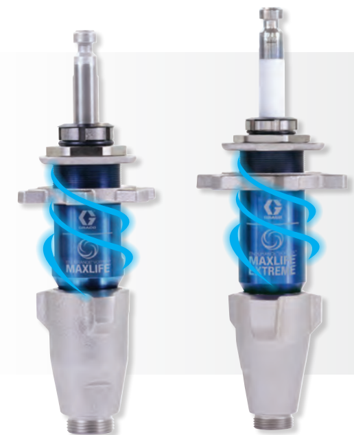
Endurance Vortex MaxLife Pump 6X longer between repacks