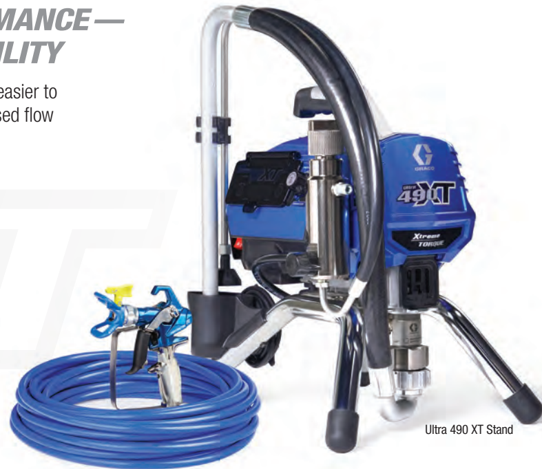
Ultra 490 XT Stand

Midsized electric airless sprayers make it easier to get more work done in a day with increased flow and production rates.